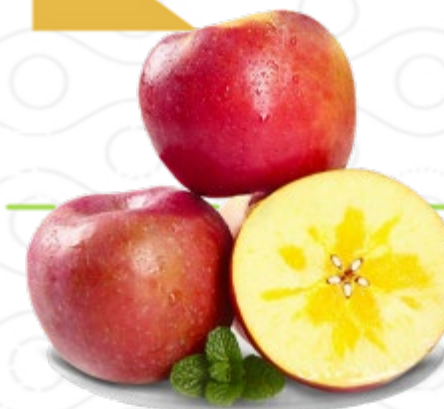
Variety : Fubrax apple Available: Oct.- next April