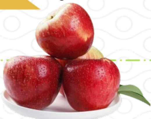
Variety : Mitchgla, Gala apple Available: Aug.-Oct.