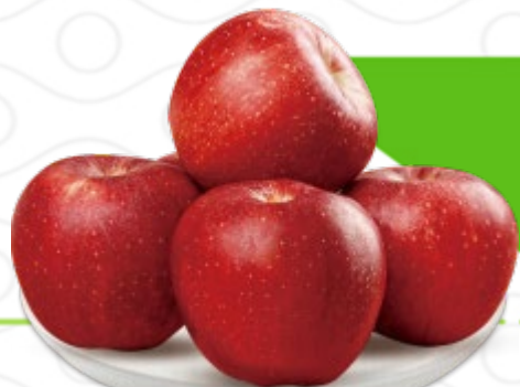
Variety : Schnico Red, Gala apple Available: Aug.-Oct.