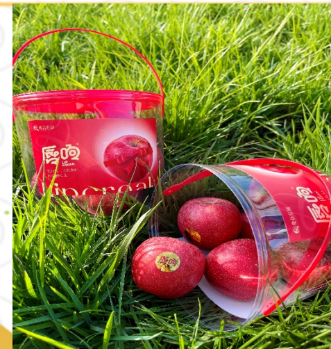
Mini hugging bucket