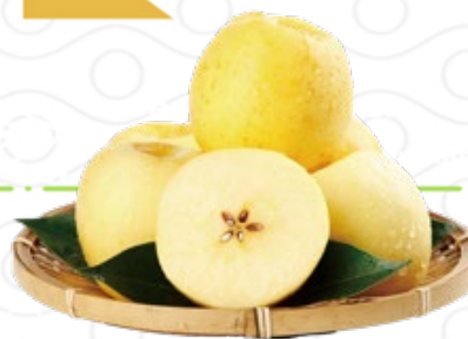
Variety : Venus Golden apple Available: Oct. – next April