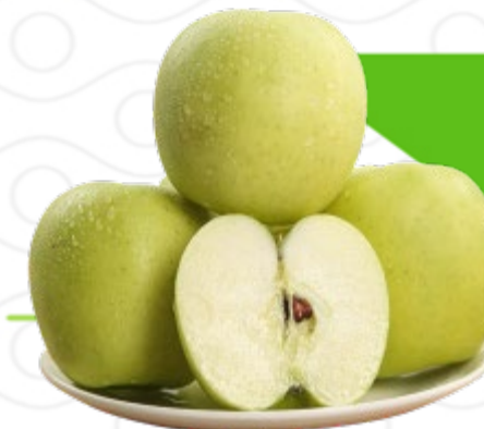
Variety : Ruixue apple Available: Oct.- next April