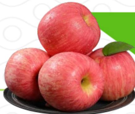
Variety : Red Fuji apple Available: Oct- next Jul.