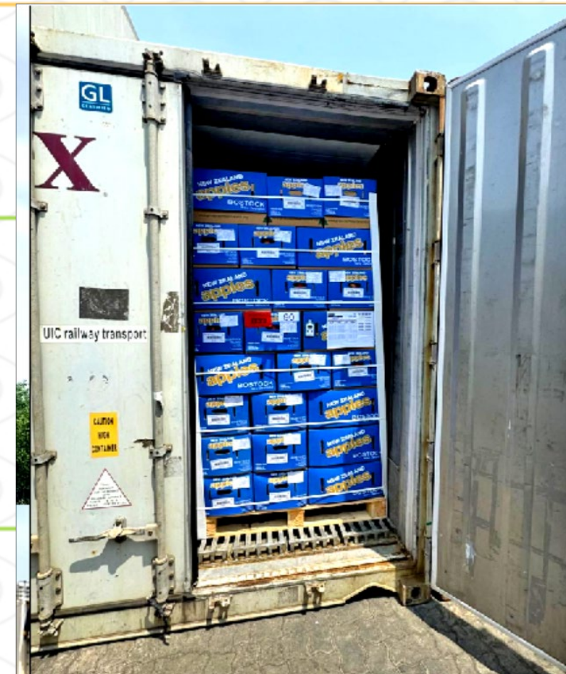
RF container transporting