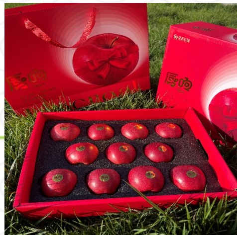
8~12 PCS in gift box